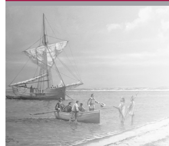
LANDING OF THE FIRST SETTLERS AT MADAKET—1659 by Rodney Charman—Collection of the Egan Maritime Foundation

Present This Map For A Discount At Participating Locations*